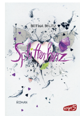
A Splintered Heart (Paperback Edition)