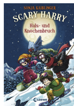
Scary Harry – Break a Legbone (Vol. 6)