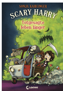
Scary Harry – The Reported Dead Live Longer (Vol. 2)