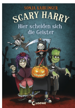
Scary Harry – Strife Among the Spooks (Vol. 5)