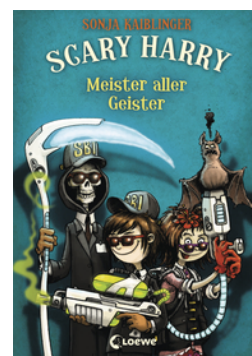
Scary Harry – Master of All Ghosts (Vol. 3)