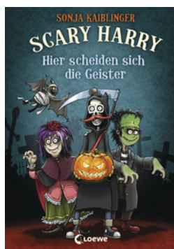
Scary Harry – Strife Among the Spooks (Vol. 5)