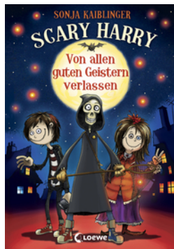
Scary Harry – Takes Leave of his Senses (Vol. 1)