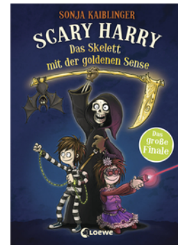
Scary Harry – The Skeleton with the Golden Scythe (Vol. 9)