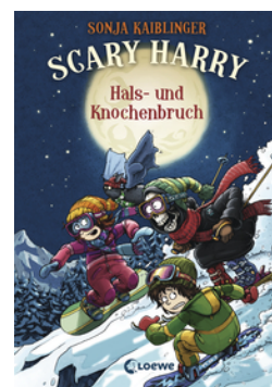
Scary Harry – Break a Legbone (Vol. 6)