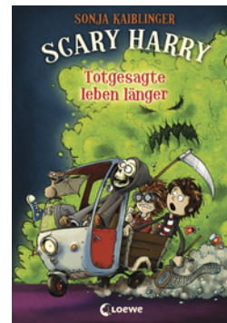
Scary Harry – The Reported Dead Live Longer (Vol. 2)