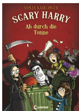
Scary Harry – Down the Can (Vol. 4)