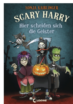
Scary Harry – Strife Among the Spooks (Vol. 5)