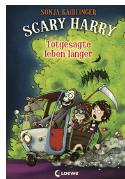
Scary Harry – The Reported Dead Live Longer (Vol. 2)