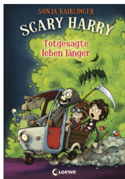
Scary Harry – The Reported Dead Live Longer (Vol. 2)