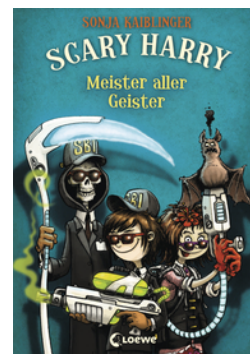
Scary Harry – Master of All Ghosts (Vol. 3)