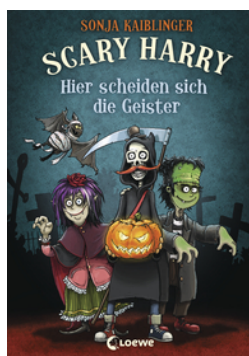
Scary Harry – Strife Among the Spooks (Vol. 5)