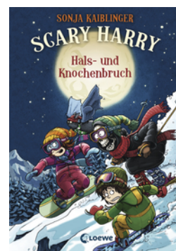
Scary Harry – Break a Legbone (Vol. 6)