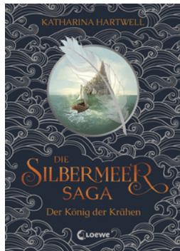
Saga of the Silver Sea – King of Crows (Vol. 1)