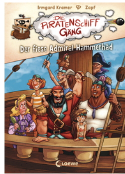
The Pirate Ship Gang – The Abominable Admiral Hammerhead (Vol. 1)