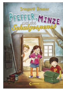
Pepper, Mint and the School Ghost (Vol. 2)