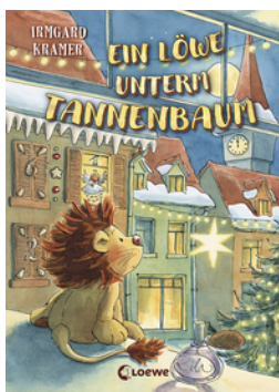
A Lion under the Christmas Tree