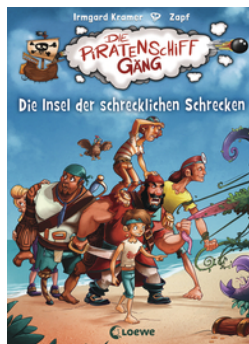
The Pirate Ship Gang – The Island of Horrible Horrors (Vol. 2)