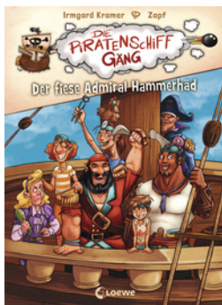
The Pirate Ship Gang – The Abominable Admiral Hammerhead (Vol. 1)