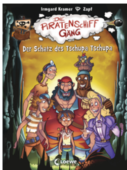
The Pirate Ship Gang - The Treasure of the Chupa Chupa (Vol. 4)