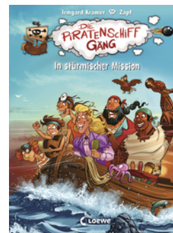
The Pirate Ship Gang – On a Stormy Mission (Vol. 3)