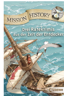
Mission History - Three Detective Stories from the Age of the Explorers