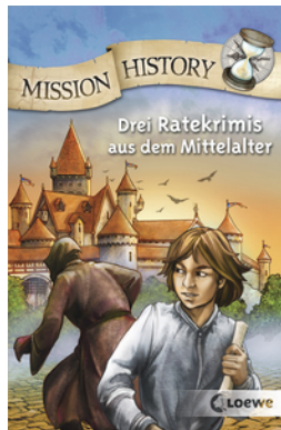
Mission History: Crime Stories in the Middle Ages