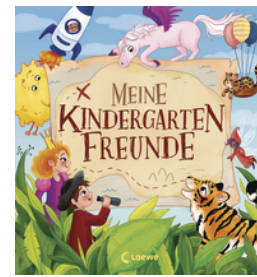
My Kindergarten Friends - Magical Creatures, Animals & Co.