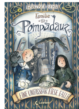
Meet the Pompadauz - An Incredibly Nasty Trap (Vol. 2)