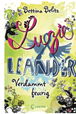
Lucie and Leander – Fierily Damned (Vol. 2)