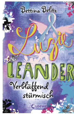
Lucie and Leander – Stunningly Stormy (Vol. 4)