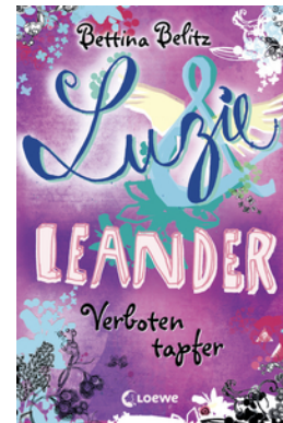
Lucie & Leander - Courageously Wicked (Vol. 6)