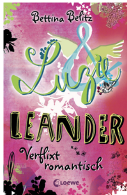
Luzie & Leander - Romantically Darned (Vol. 8)