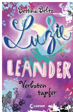
Lucie & Leander - Courageously Wicked (Vol. 6)