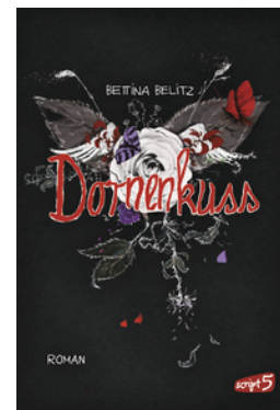
A Thorned Kiss (Vol. 3)