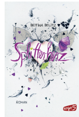
A Splintered Heart (Paperback Edition)