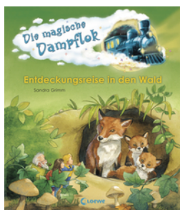
The Magic Steam Engine - In the Forest