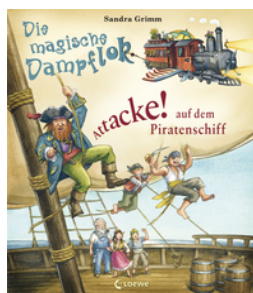
The Magic Steam Engine - Attack On Board The Pirate Ship!