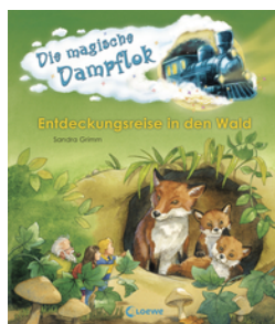
The Magic Steam Engine - In the Forest