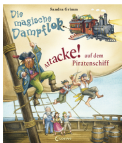
The Magic Steam Engine - Attack On Board The Pirate Ship!