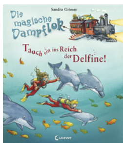
The Magic Steam Engine - Among the Dolphins