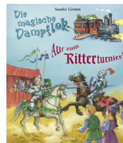
The Magic Steam Engine - Jousting At The Knight's Castle