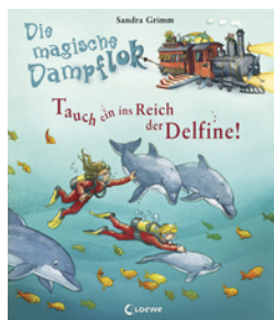
The Magic Steam Engine - Among the Dolphins