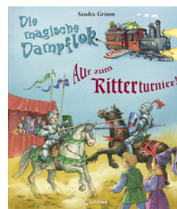
The Magic Steam Engine - Jousting At The Knight's Castle