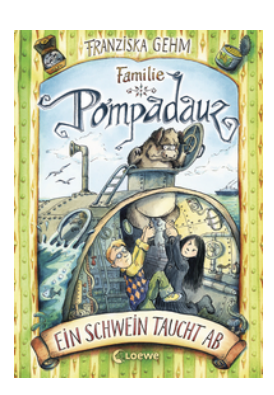
Meet the Pompadauz – A Pig Pops Up (Vol. 3)