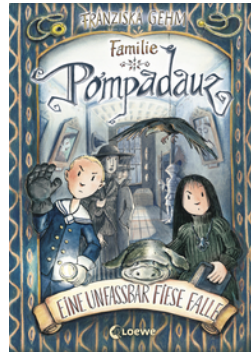
Meet the Pompadauz - An Incredibly Nasty Trap (Vol. 2)