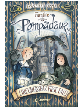
Meet the Pompadauz - An Incredibly Nasty Trap (Vol. 2)