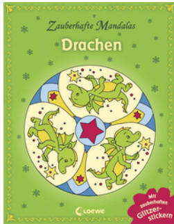
Enchanting Mandalas - Dragons