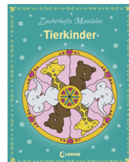
Enchanting Mandalas: Baby animals