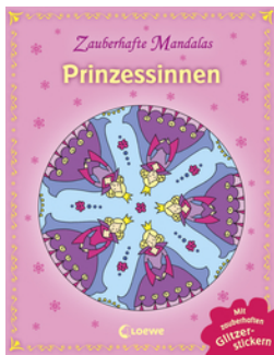
Magical Mandalas Princesses