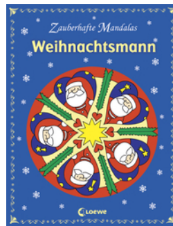
Enchanting Mandalas - Father Christmas