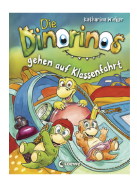
The Tiny Dinos Go on a School Trip (Vol. 5)