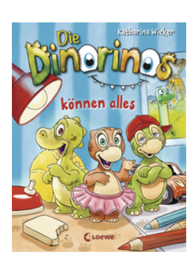
The Tiny Dinos Can Do Everything (Vol. 1)