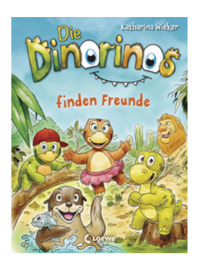
The Tiny Dinos Make Some New Friends (Vol. 3)