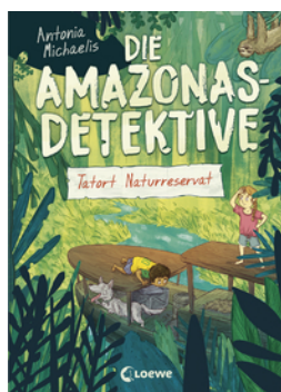
The Amazon Detectives (Vol. 2) Crime Scene: Nature Reserve