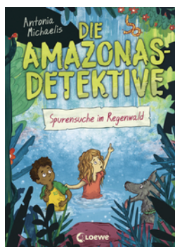
The Amazon Detectives (Vol. 3) Searching for Traces in the Rainforest