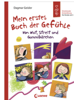
My First Book of Feelings