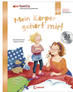
My Body Belongs to Me from My Head to My Toes - Jubilee Edition