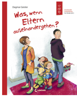
If My Parents Are Divorced: How to Talk about Separation, Divorce, and Breakups