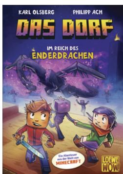
The Villagers - In the Empire of the Enderdragon (Vol. 4)