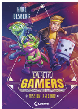
Galactic Gamers – Mission: Asteroid (Vol. 2)