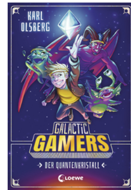
Galactic Gamers - The Quantum Cristal (Vol. 1)