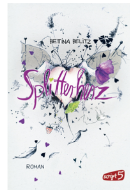
A Splintered Heart (Paperback Edition)