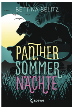
Panther Summer Nights