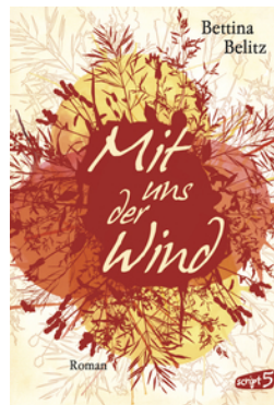
The Wind With Us