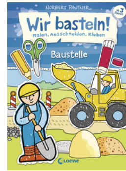
Let's Do Arts and Crafts! - Construction Site