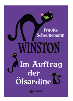
Winston – The Case of the Tinned Sardine (Vol. 4)