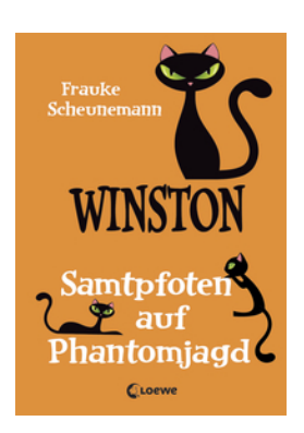
Winston - Velvet Paws on a Phantom Hunt (Vol. 7)