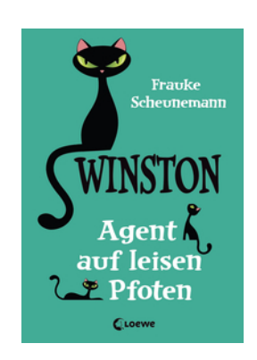
Winston – Agent on Silent Paws (Vol. 2)