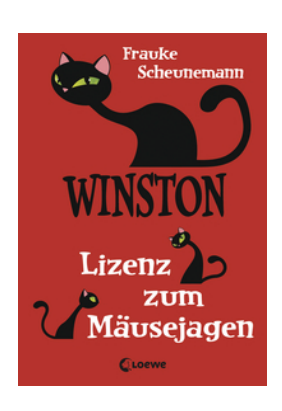
Winston – License to Prowl (Vol. 6)