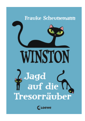
Winston – Hunting the Safe Box Thieves (Vol. 3)