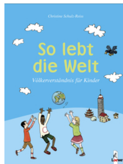
How The World Lives