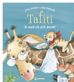
Tafiti – That’s How You Get Well