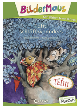
Picture Mouse - Tafiti Sleeps Somewhere Else