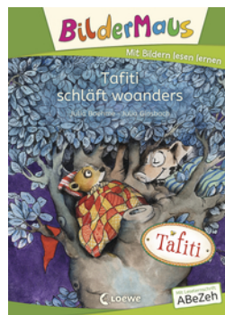
Picture Mouse - Tafiti Sleeps Somewhere Else