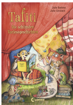
Tafiti – The Best Story Time Adventures for Reading Together