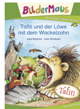
PictureMouse - Tafiti and the Lion with the Wobbly Tooth