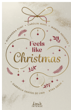
Feels Like Christmas