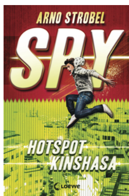
SPY - Hotspot Kinshasa (Vol. 2)