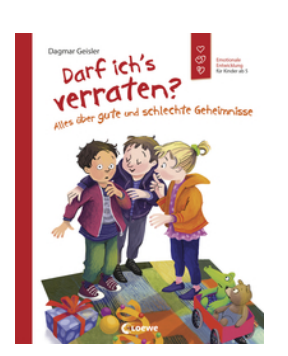
Can I Tell? All About Good and Bad Secrets