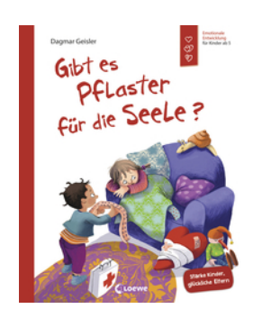
Safe Child, Happy Parent – Are there Plasters for the Soul?