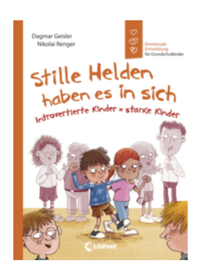
Silent Heroes Have it Within Them - Introverted Kids = Strong Kids