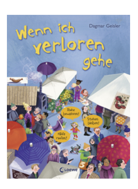
When I Get Lost