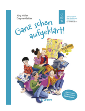
Quite Enlightened! When Boys and Girls Become Men and Women