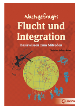
Guide to Refugee Migration and Integration