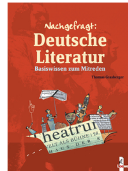
Guide to German Literature