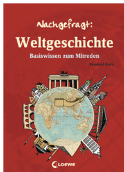
Guide to World History