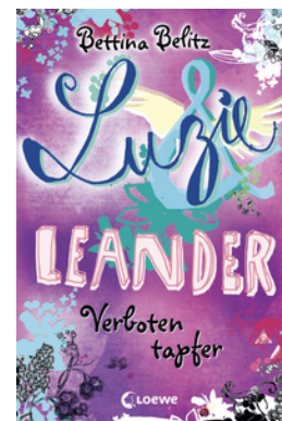
Lucie & Leander - Courageously Wicked (Vol. 6)