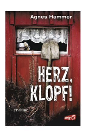
A Beating Heart