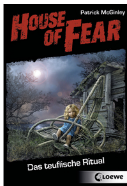
House of Fear – The Devilish Rite (Vol. 6)