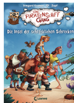
The Pirate Ship Gang – The Island of Horrible Horrors (Vol. 2)