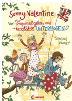
Sunny Valentine – Tropical Birds and Royal Unterpants (Vol. 1)