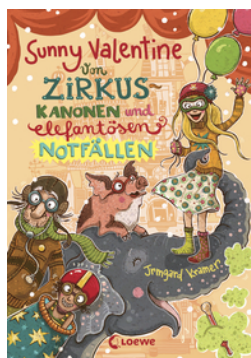
Sunny Valentine – Circus Cannons and Elephantine Emergencies (Vol. 4)