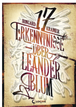
17 Things I've Learned about Leander Blum