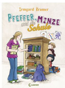
Pepper, Mint and School (Vol. 1)