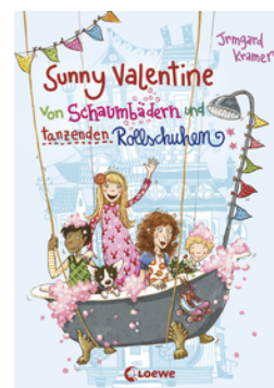
Sunny Valentine – Foam Baths and Dancing Roller-Skates (Vol. 2)