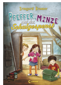
Pepper, Mint and the School Ghost (Vol. 2)