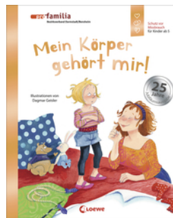
My Body Belongs to Me from My Head to My Toes - Jubilee Edition