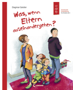
If My Parents Are Divorced: How to Talk about Separation, Divorce, and Breakups