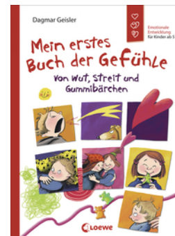
My First Book of Feelings