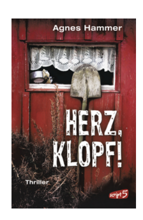
A Beating Heart