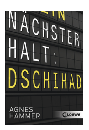
Next Stop: Jihad