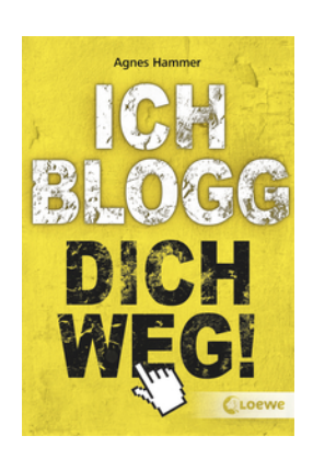
I'll Blog You Away!