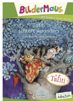
Picture Mouse - Tafiti Sleeps Somewhere Else