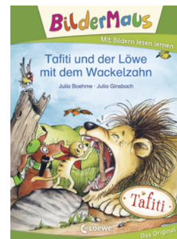
PictureMouse - Tafiti and the Lion with the Wobbly Tooth