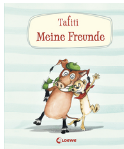
My Friends - Tafiti