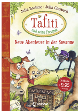
Tafiti and His Friends - New Adventures in the Savannah (Vol. 4-6)