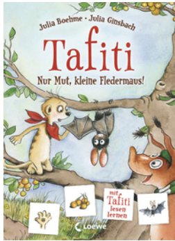
Tafiti – Be Brave, Little Bat!