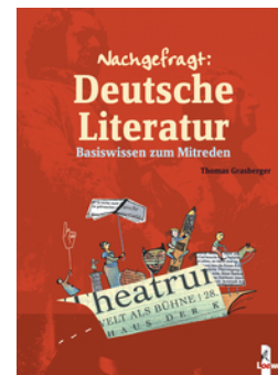
Guide to German Literature