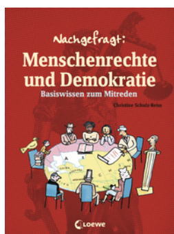
Guide to Human Rights and Democracy