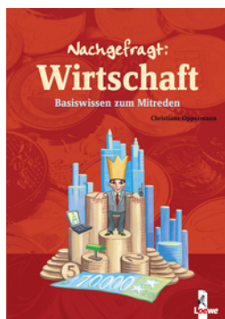
Guide to Economics