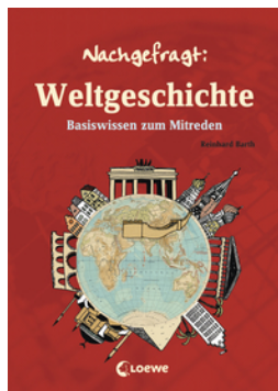
Guide to World History