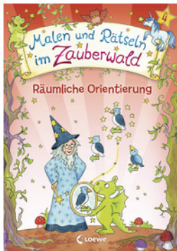
Drawing and Quiz-Solving in the Enchanted Forest - Spatial Orientation