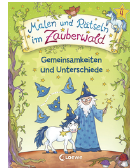
Drawing and Puzzle-solving in the Enchanted Forest - Similarities and Differences