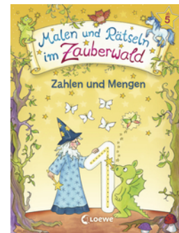
Drawing and Quiz-Solving in the Enchanted Forest - Numbers and Quantities