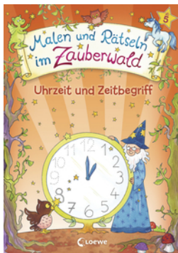
Drawing and Puzzle-solving in the Enchanted Forest - Time