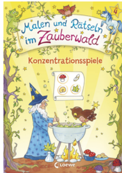
Drawing and Puzzle-solving in the Enchanted Forest - Concentration Games