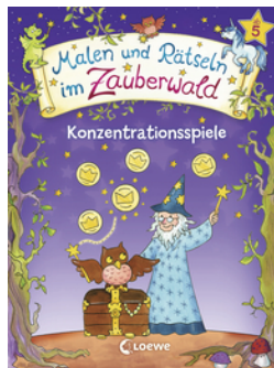
Drawing and Quiz-Solving in the Enchanted Forest - Concentration