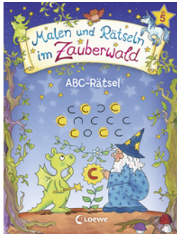
Drawing and Puzzle-solving in the Enchanted Forest - ABC-Quiz