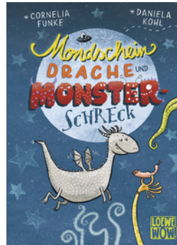
Moonshine Dragon and Monster Shock