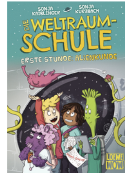
Space School – Science of Aliens (Vol. 1)