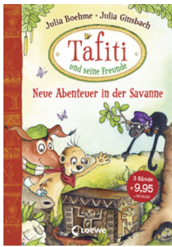
Tafiti and His Friends - New Adventures in the Savannah (Vol. 4-6)