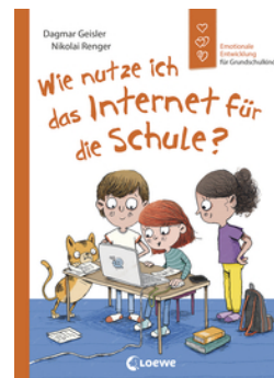
Safe Child, Happy Parent How Do I Use the Internet for School?