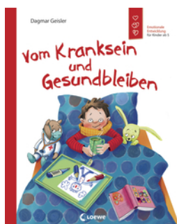
When I Get Sick: About Becoming Ill and Feeling Better