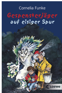
Ghosthunters on Icy Trails