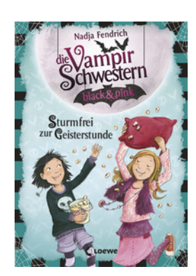
The Vampire Sisters black&pink - Home Alone During Witching Hour (Vol. 3)