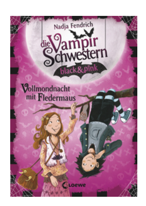
The Vampire Sisters black&pink - The Bat and the Full Moon (Vol. 2)