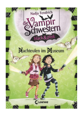
The Vampire Sisters black & pink - Night Owls in the Museum (Vol. 6)