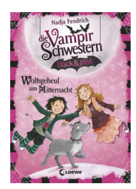
The Vampire Sisters black&pink - Howling of Wolves at Midnight (Vol. 4)