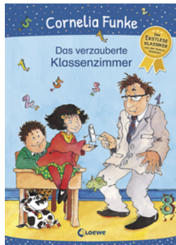
First Reading-Classic - The Enchanted Classroom