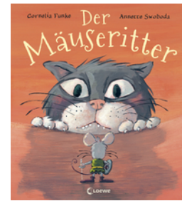
The Mouse Knight