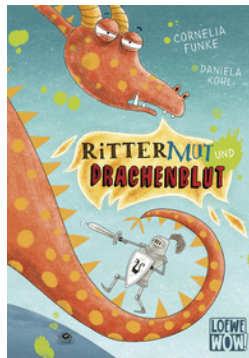
Knighthood and Dragon's Blood