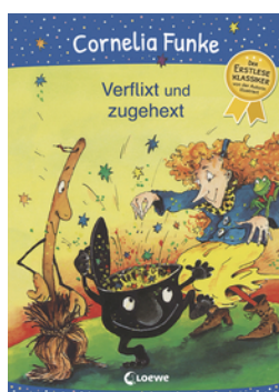
First Reading-Classic - Blessed and Bewitched