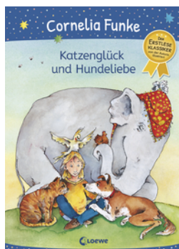
First Reading-Classic - Cat Luck and Dog Love