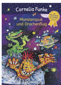
First Reading-Classic - Monster's Spook and Dragon Flight