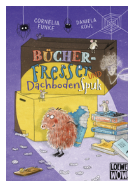
Book Crunchers and Attic Hauntings