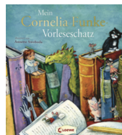
My Cornelia Funke-Reading Treasure